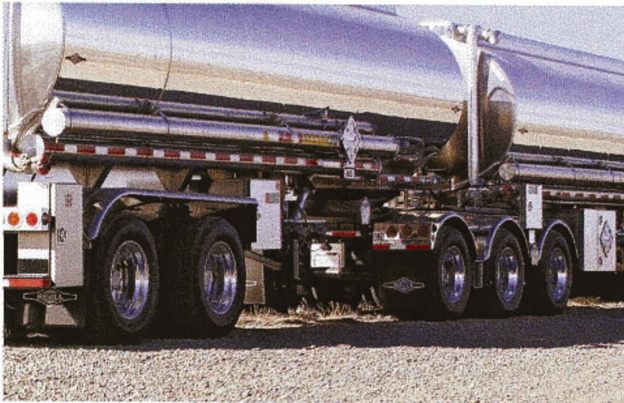
Buffed Aluminum finish is standard on all Beall b-trains; external vapor recovery shown here

Over 100 Years of experience and customer satisfaction goes into every Beall Trailer. Craftsmanship, Engineering and hard work make every Beall stand up against the test of time, rough roads and anything that nature or industry can throw at it.