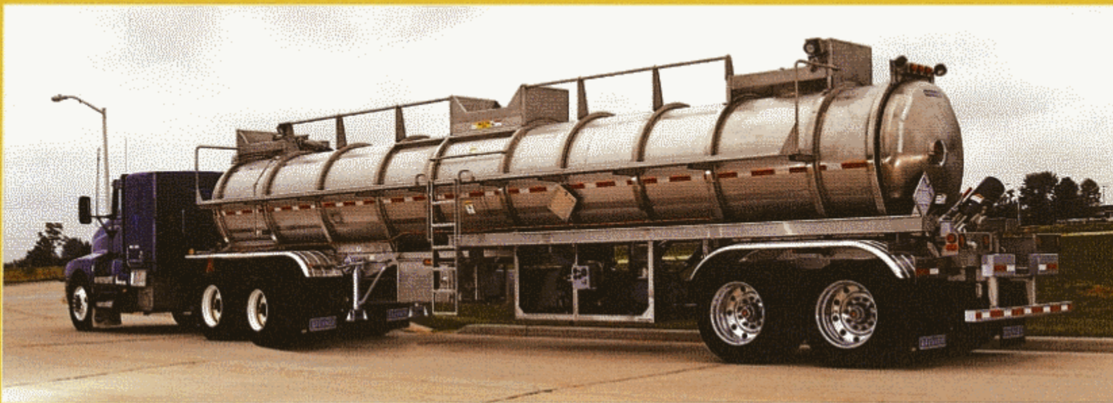
DOT 412 SS STRAIGHT ROUND VACUUM TANK TRAILER

Brenner Tank and our manufacturing partners utilize vigorous testing to ensure our chassis yield the best possible reliability.