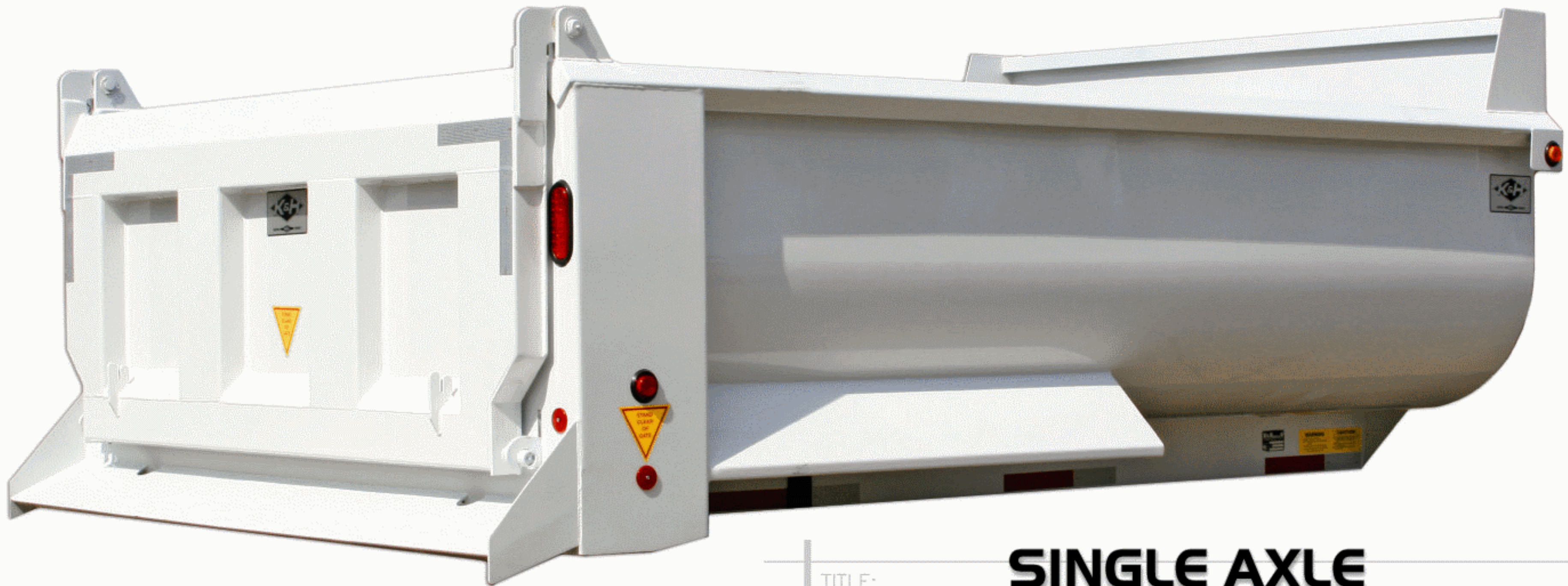
TITLE: SINGLE AXLE SEMI-ELLIPTICAL DUMP BODY